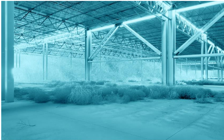
Chansook Choi, the tumble still , 2023.